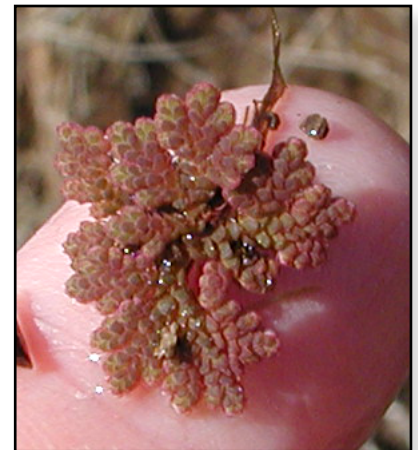
Azolla or “mosquito fern”

Both watermeal and duckweed prefer stagnant or slow-moving water. By adding aeration, it might be possible to eliminate the growth of both plants, or limit it to only the pond edges. Aeration will also reduce the chances of a fish kill due to low dissolved oxygen.