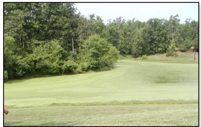
Pond covered with watermeal and duckweed

The potential problems caused by duckweed and watermeal fall into two categories. On calm, still days the plants will spread over the entire surface of the pond, giving it an even, green appearance. This can be aesthetically unpleasant, a recreational or production nuisance, and even has the potential to be unsafe by fooling the unaware individual into thinking there is no pond present.