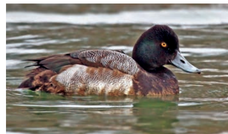
Figure 1. From left to right; adult male lesser scaup in breeding plumage, female, and a male lesser scaup in non-breeding plumage. From Cornell Lab of Ornithology and the Macaulay Library. <a href="https://www.allaboutbirds.org/quide/Lesser-Scaup/id">https://www.allaboutbirds.org/quide/Lesser-Scaup/id</a>

Lesser scaup can be found throughout Canada and the United States (including Hawaii), to Panama, the West Indies and the northern shore of Venezuela (Figure 2). These ducks are often found on inland waters in flocks. They are slow to migrate, often not leaving until the water freezes over. They feed on snails, clams, aquatic insects, small fish, seeds and pondweeds. They eat by diving and swimming underwater or by sticking their tails out of the water when feeding in shallow water. Lesser scaup have also been reported to feed at night.