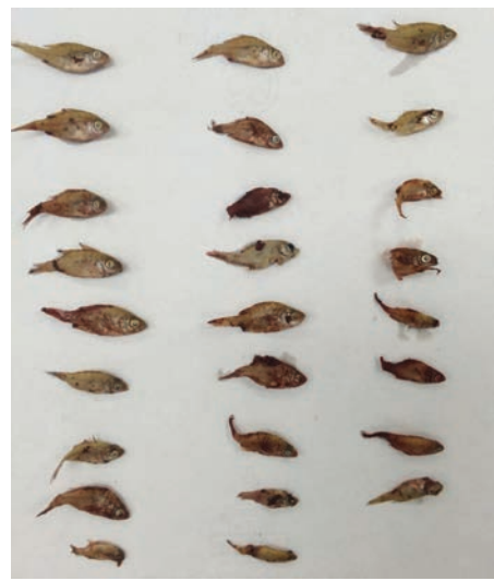
Figure 4. Twenty-six centrarchids removed from the esophagus and crop of a lesser scaup on an Arkansas sportfish farm in central Arkansas.

which occurred in 42.7 percent of the lesser scaup examined. A similar study conducted on sport-fish ponds in 2015 revealed that 82 percent of the lesser scaup examined had fish as part of their diet (Figure 4 and 5). These studies show that lesser scaup consume considerably more baitfish than originally thought.