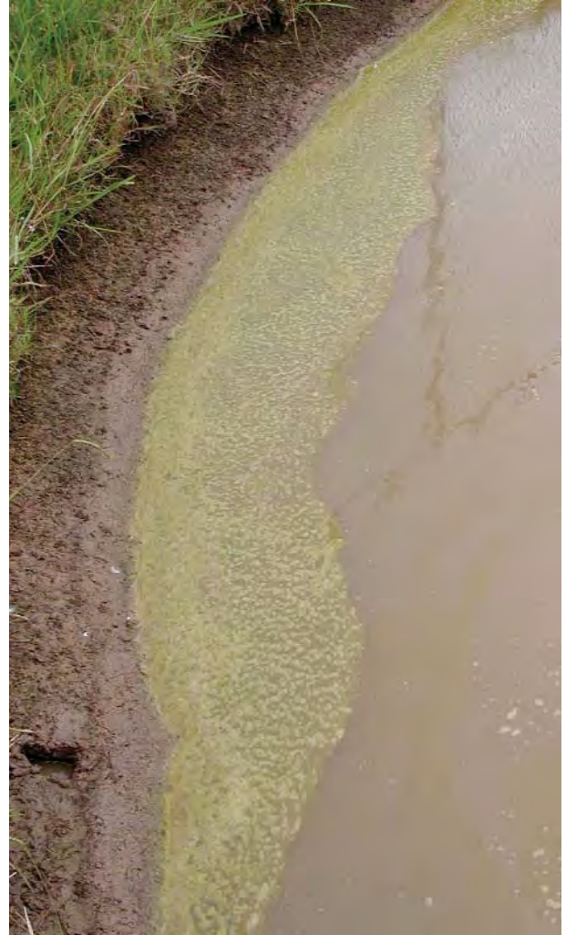
Figure 18. Scum filled with bubbles along a pond edge.