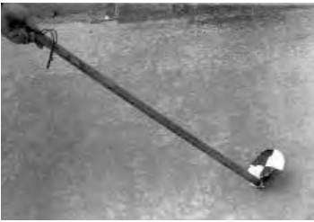
Figure 6. A Secchi disk is used to estimate the concentration of algae in water.