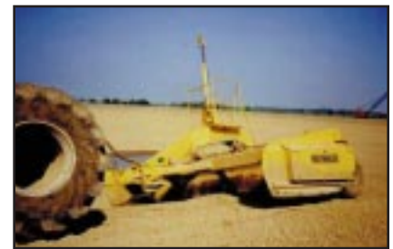
Figure 2. A small dirt pan (dirt bucket) is used for finishing work in rebuilding levees.

Alternatively, after the pond bottom dries enough to support a wide-track dozer, use the dozer to push moist pond bottom soil to the levees. The dozer rolls up on the levee to pack the material back in place. Then use tractor-drawn dirt pans (Fig. 2) to finish the pond to grade, leaving a smooth surface that slopes to the drain. Bulldozers and dirt pans can be used to rebuild ponds as small as 1 / 4 acre. Laser sights on the equipment help the operator maintain the appropriate pond bottom slope.