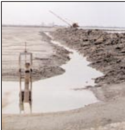
Figure 3. The first step in the Mississippi method of rebuilding ponds uses a dragline to dig a drainage ditch around the levee.

A new technique of some Mississippi Delta farmers uses a dragline and bulldozer only. This method is usually reserved for ponds with deep sediments (more than 2 feet deep) in ponds not drained in 10 to 15 years. The Mississippi method involves draining the pond as usual for a complete reconstruction. After all the water is gone, the dragline digs a 3- to 4-foot-deep drainout ditch along the levee base around the entire pond, which allows water to weep from the pond sediments and leave at the drain (Fig. 3).