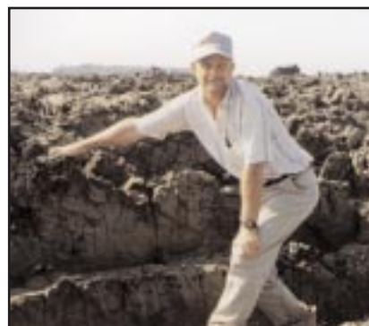
Figure 5. Rows of pond bottom sediments are usually 4 to 5 feet high.

The sediment should be soft enough to still flow slightly. If allowed to dry too much, the mud pushes down the pond rather than flowing to the sides. The goal is to row up the mud (pile the bottom sediments in rows) down the pond length for good drainage and quick drying. You may need to make more than one pass, several days apart, to complete this stage of the process. The rows will be 4 to 5 feet high and of equal width, with the parent soil showing slightly between the rows (Fig. 5). Rains will drain off the rows and flow down the channels left by the bulldozer.