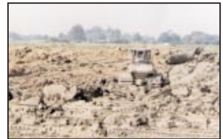
Figure 6. After material in the rows has dried to a heavy plastic consistency, pack the soil back against the levees.

Allow the rows to dry for 2 to 3 weeks, depending on rainfall, or until the rows are a heavy plastic consistency. Then, bulldoze across the rows starting at the pond center, moving toward the nearer levee. The push should pack the entire distance to the levee (Fig. 6). When all the sediment has been packed back into the levee slopes, top a small amount of the original clay from the pond bottom back over the packed sediment material. This minimizes erosion during the early period when the pond is refilled.