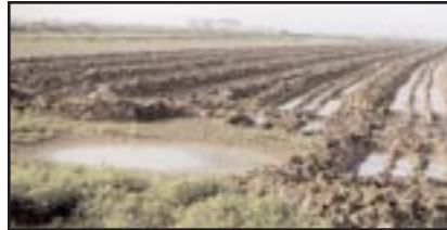
Figure 4. After pond bottom sediments become firm enough to flow, use a dozer to row up the material.

ramp to allow a size 65D bulldozer to cross into the soft sediments. The bulldozer makes passes down the pond length, rowing up the soft sediment on either side of the blade on each pass (Fig. 4).